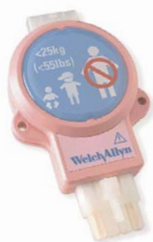
Welch Allyn Paediatric Energy Reducer

(has 3mm bleed on right edge - magenta keyline does not print)